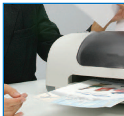
With GO-Global, remote users can easily access the centralized SAP application and can print reports locally.

GO-Global for a number of reasons, including product performance, functionality, ease of deployment, price, and support.